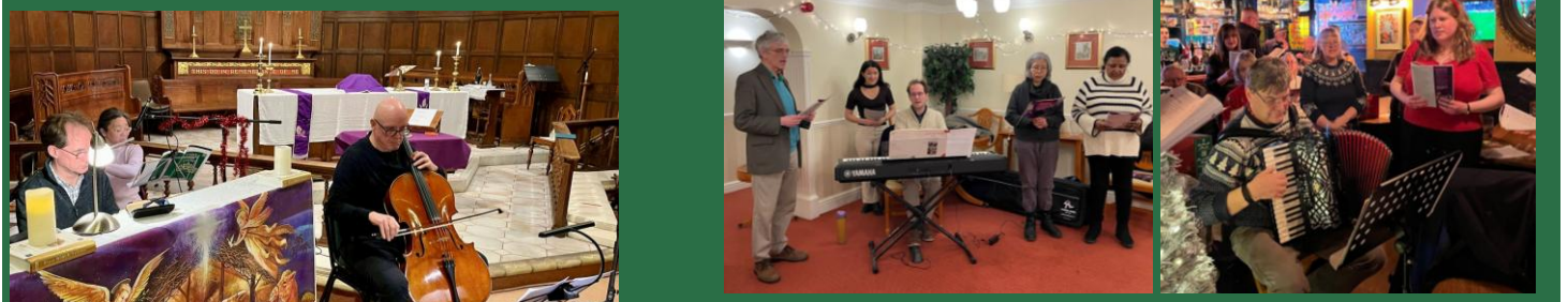
Carol singing Argent Court and the Lord Kitchener Pub