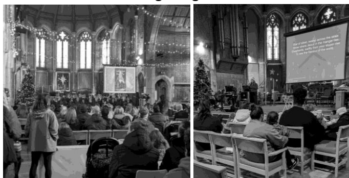
Livingstone Assembly; Highview Nursery at Singalong

Visitors at Christmas Over Christmas, we were pleased to welcome Livingstone School for their Christmas assembly, and Highview Nursery (who rent our downstairs rooms) who joined us for our Christmas carol singalong.