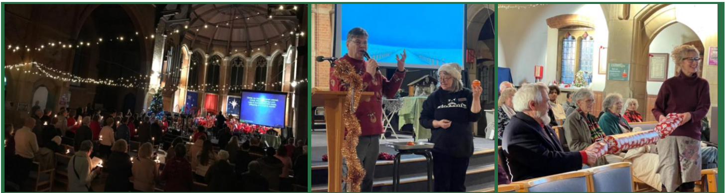
Christmas at St James's Above: Carol service; Christingle; Christmas Day Below: Santa at Christmas Fun Day; Nativity Service; Carol Singalong; Santa at Toddler parties