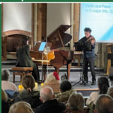
Piano recital at St James; Paws in the Pews at Holy Trinity; Morning Table at Holy Trinity; Rooted Youth