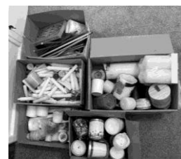
Boxes of candles from St James & Holy Trinity

Candles for Ukraine This year we again donated used and unused candles to the 'Lights for Ukraine' initiative. The candles have been sent to Ukraine to provide light and heat during the frequent power cuts over the winter. The partly-used candles were melted down to make new ones.