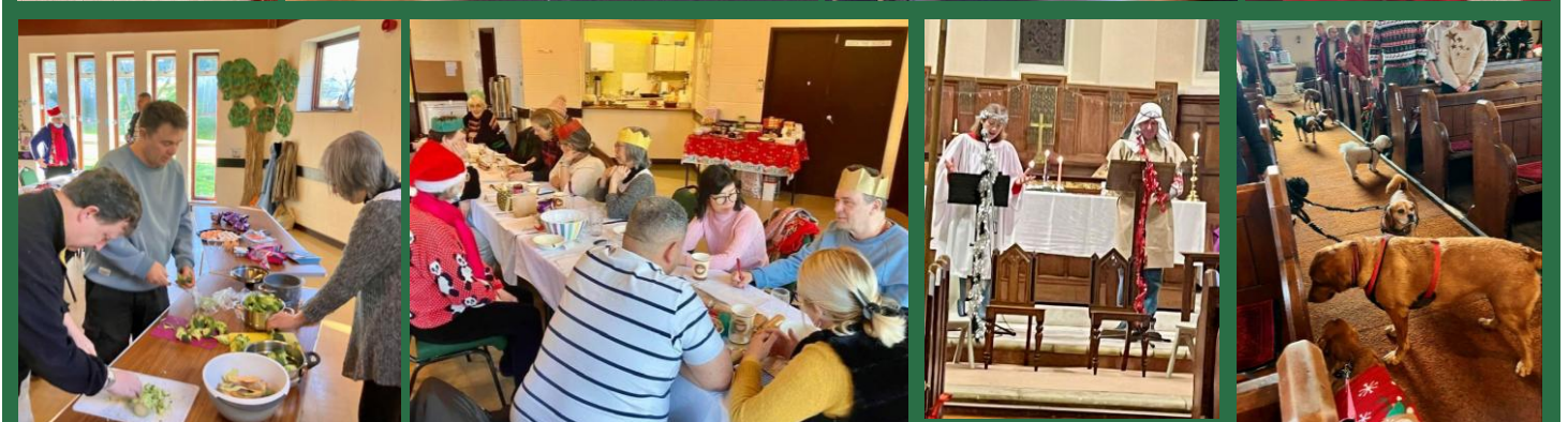
Christmas at Holy Trinity Above: Christmas Day lunch (x2); Nativity Service; Paws in the Pews Below: Reflective Carol Service