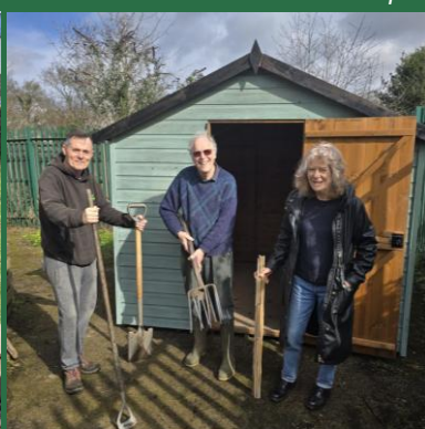
Jim's Shed @ EBVBC